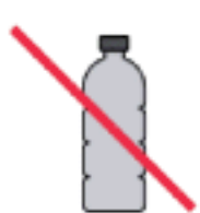
EMPTY PLASTIC WATER BOTTLE