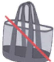
OVERSIZED TOTE BAG